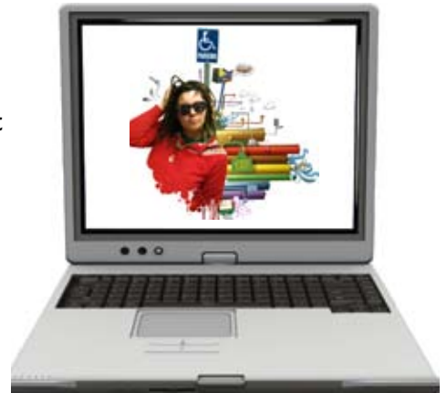
Photomontage on screen by Grant Bielefeld

Cost: $150 per workshop; all materials included—Two (2) graduate credits are available through Bemidji State University, for a cost of $100 per credit. Additional work is required to earn these credits.